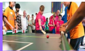
Table Cricket /Table Tennis