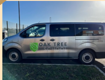
Oak Tree School Minibus (used for trips)